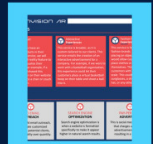
Entrepreneurship: Independent Business Plan