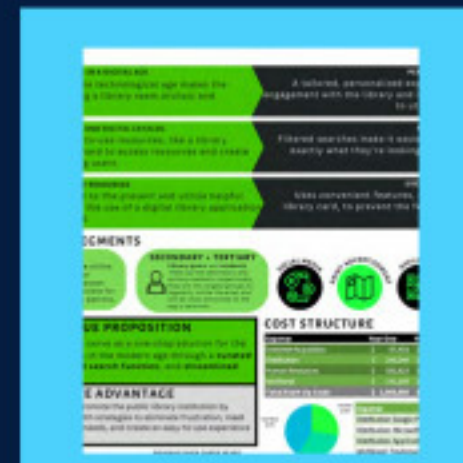
Entrepreneurship: Start-up Business Plan